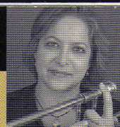
Jazz Trombone & the microphone —Page 30