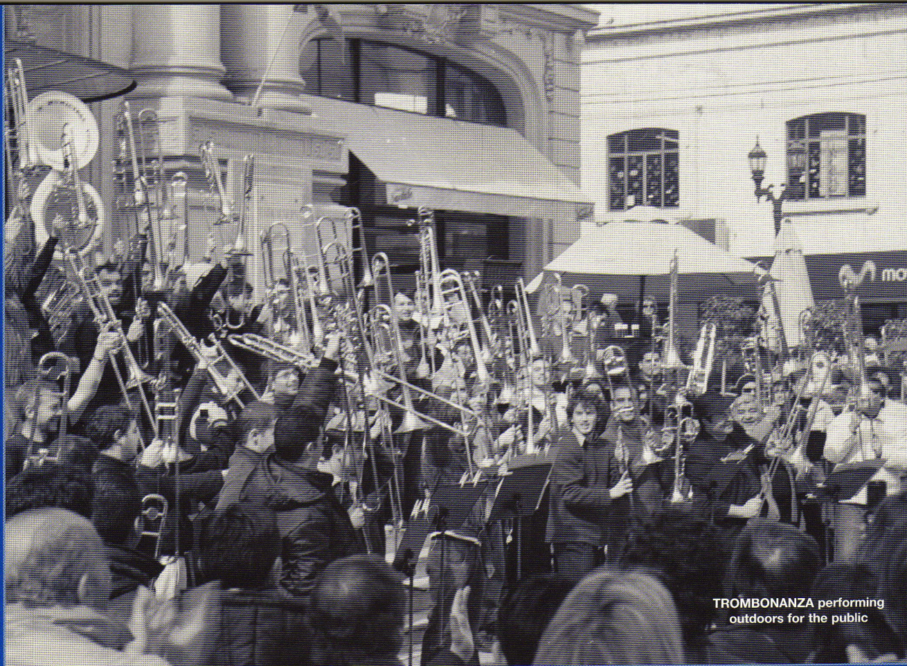
TROMBONANZA performing outdoors for the public

While it is difficult to fully describe the aura and spirit of TROMBONANZA , it can safely be said that this is one of the greatest musical conferences and trombone events held anyplace in the world. To see outstanding professional players standing beside young trombonists making music together is an emotional experience of the highest sort. TROMBONANZA as a music event coupled with the spirit generated during the week is a model and inspiration for all.