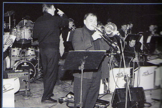
Remigio Pereira soloing with Big Band and Conrad Herwig conducting