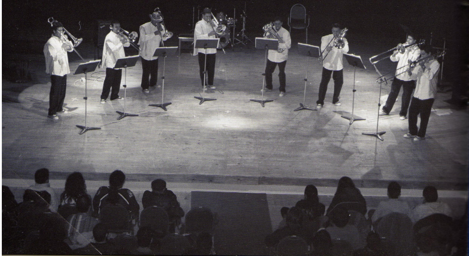
Below: Colombian Trombone Ensemble